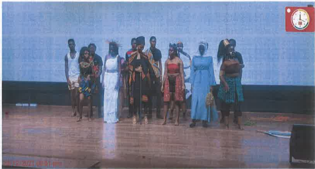
Foreign students are depicting their culture through their traditional dress on 29.12.2021