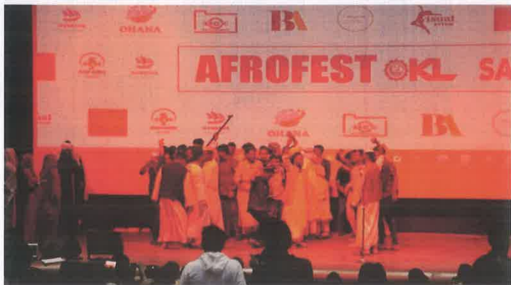
Foreign students are depicting their culture on 29.12.2021